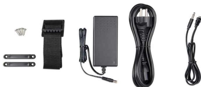
Fixing strap Adapter Power cable Push-button with cable (2m) and dual-colour LED