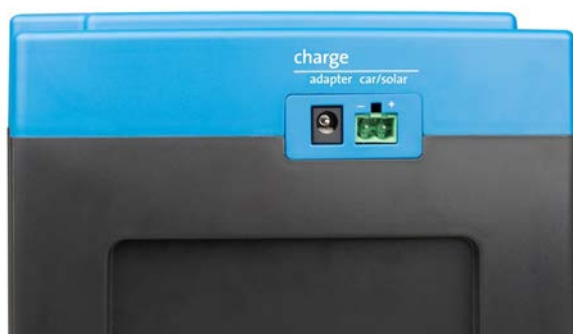
Adapter and input vehicle / solar panel (car/solar) (socket for the car/solar input comes supplied)