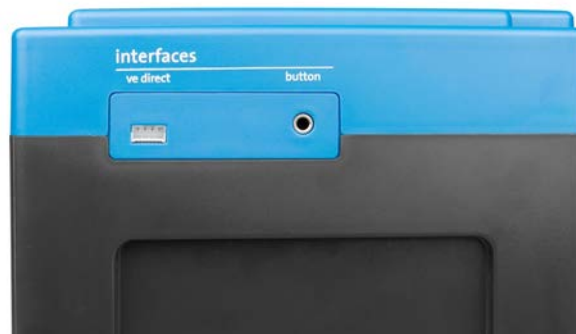
VE.Direct and push-button